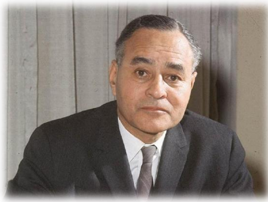
Dr. Ralph Johnson Bunche