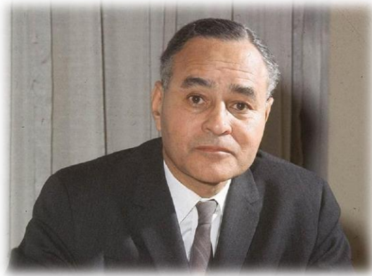
Dr. Ralph Johnson Bunche